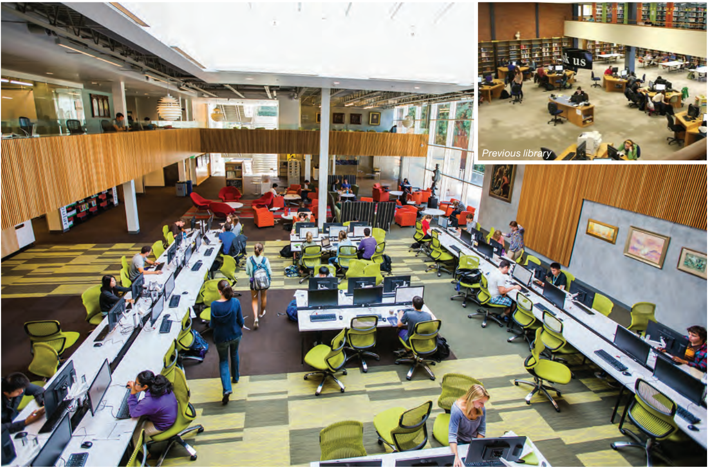
In the Resource Center on the main floor, Knoll Antenna tables with Fence create a work space that's open, cost effective and efficiently supports students.