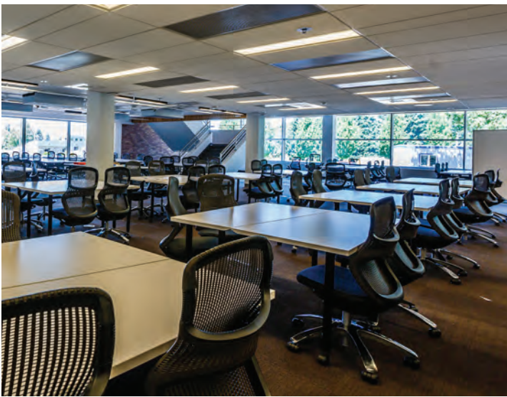
Top: Refuge spaces are located on the Basement Level, designated as a quiet area.