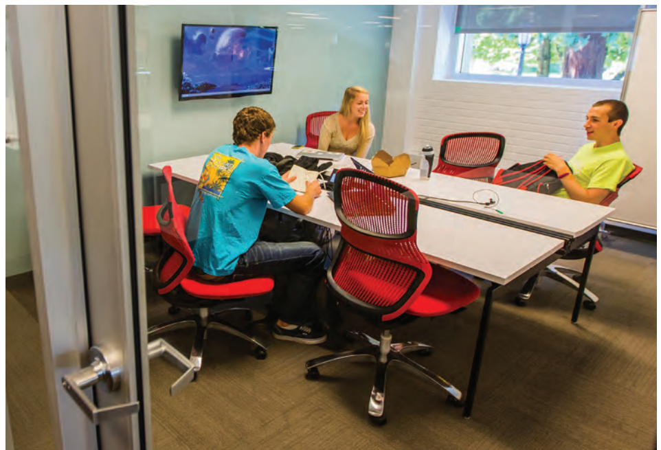
A variety of study rooms provide enclosed spaces for activities that require privacy and protection from interruption.