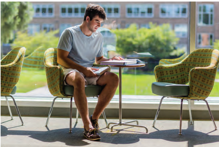
Top: Multigeneration chairs in the top-floor classroom support multiple postures and a diversity of people in group spaces.

For more case studies, visit knoll.com/research