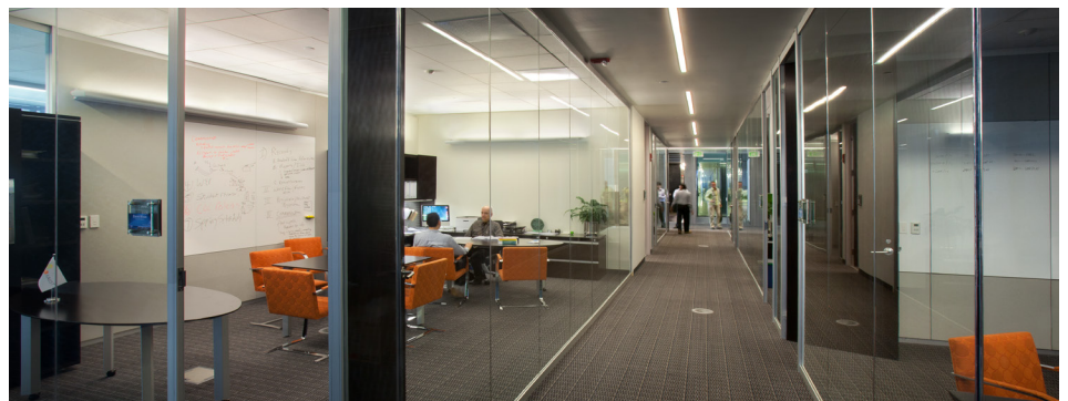
Scientist offices function as both private workspaces and collaborative teaming spaces for research development and investigation. Featured: AutoStrada Storage and Tables, Florence Knoll Table Desk, Brno Chairs.

Designing and building spaces while the university itself was still in development was unprecedented, but necessary in order to meet the highly condensed construction schedule. Without an established program, curriculum, faculty or students, spaces had to be highly flexible and adaptable to meet the needs of an institution still in the formulation stage.