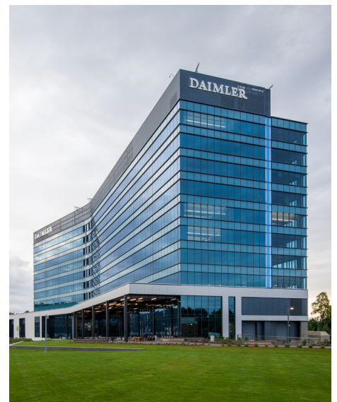
Daimler Trucks North America's new headquarters in Portland is located on Swan Island, an industrial area along the Willamette River near the Pacific Coast of Oregon.