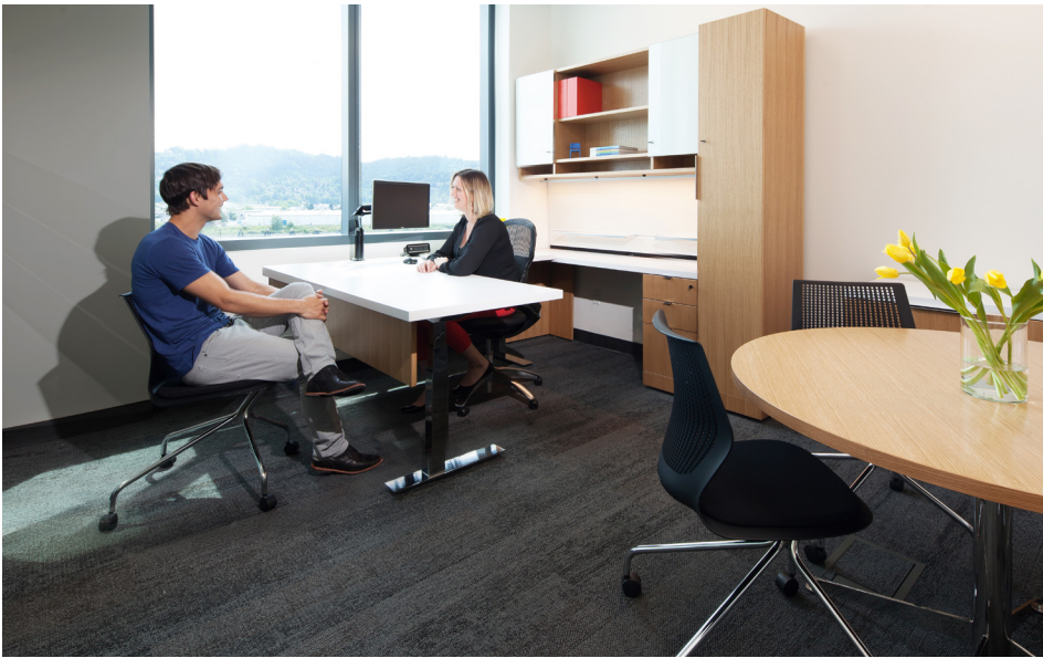
For employees who need private meeting space, MultiGeneration by Knoll Hybrid Chairs and a side table with a Reff Profiles credenza offer both meeting and storage areas.