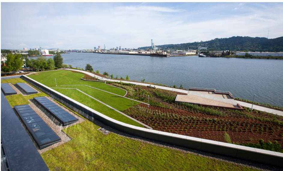
Daimler's headquarters offers plenty of beautiful outdoor spaces for employees, including a bike path along the Willamette River.

In particular, the facilities team wanted to diminish the isolation that large cubicles can create. "It was too easy for employees to isolate themselves in their cubicles and then be unhappy about lack of communication," says Markstaller. "We knew that we wanted to do something different and bring the walls down."