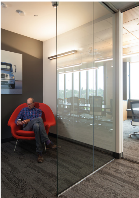
Left: Glass walls for meeting rooms allow for privacy but still let in natural light. A bold, red Womb chair and the artwork both keep Daimler's products top of mind.