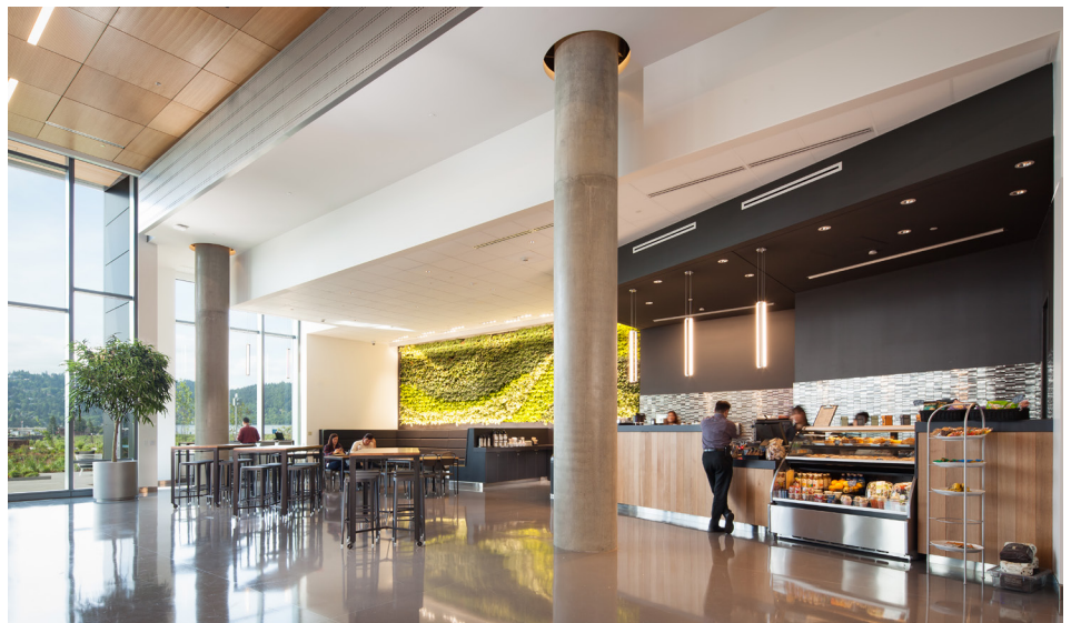
Top: Employees can connect and relax in comfortable, shared areas with beautiful views of surrounding hills, the Willamette River and downtown Portland.

Featured Products: Architecture & Associés Sofa; k.™ lounge Stool; Power Cubes; Womb Chairs