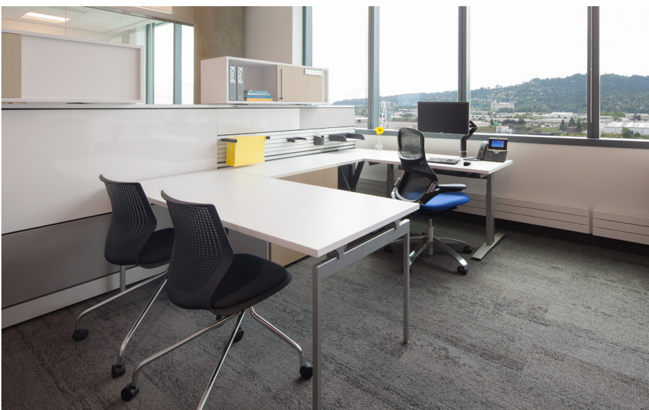
Workstations for managers include room for casual meetings with visitors. All meetings happen within the open floor plan, encouraging a sense of trust and teamwork amongst employees.