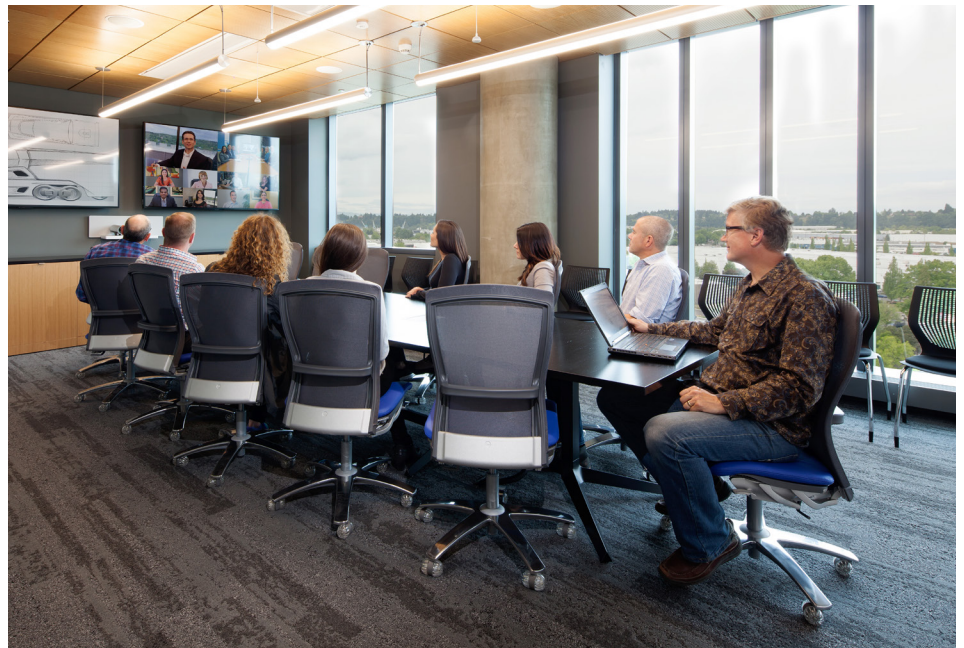
Featured Products: Life chairs, Dividends Horizon Table, Reff Profile Credenza