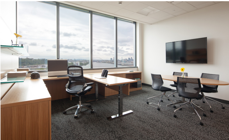
Executive offices include wall-mounted monitors and full meeting tables to gather employees and discuss topics in private.