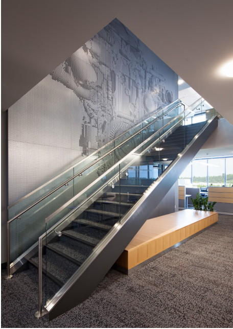
Daimler engineers' sketches of engines and parts have been incorporated onto the walls of the headquarters, showcasing the results of the intellect and hard work of its employees.

On every floor of the building, collaboration spaces encourage employees to gather, talk and share ideas. Every shared area offers electrical outlets for device charging, whiteboards and attractive, colorful, comfortable furniture.